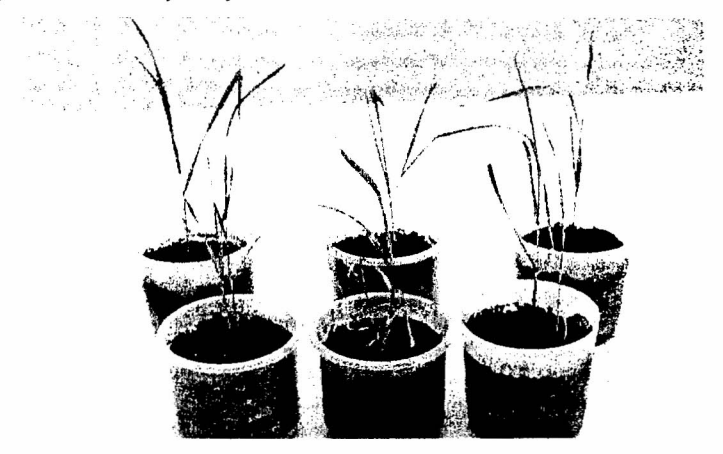
Fig. 1. Established plants

Plantlets of 10-12 cm length with sufficient root system, were transplanted to 10 cm plastic pots containing garden soil, sand and cowdung in the ratio of 1:2:1 (Fig. 1). Immediately after transplantation, the plants along with the pots were covered with moist polythene bag, kept in a growth room for 7-15 days under controlled environment. The interior of the polythene bags were sprayed with distilled water at every 24 hrs. At the same time, plantlets were also nourished with Hoaglands solution. Finally, after 15-20 days they were transferred to the field environment.